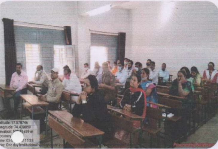
Teaching faculty and Non-Teaching faculty participated in Code of Conduct workshop.